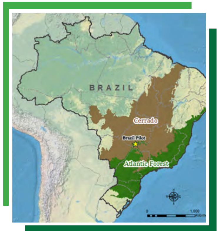
Figure 1. SVAA site in relation to major biomes of Brazil.

The Collaboration recognized the need for a decision support system to identify the most important areas for conservation and to provide land owners with streamlined options for Forest Code implementation. Thus, the team advanced a tool that uses